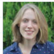
ANDUK RAGOT GS c & CE1 a